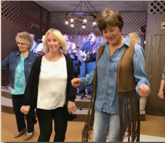
Steppin' out at the Blue Grass Show in Pikeville's Nickel Row!