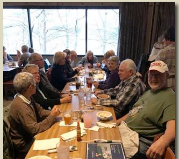
The Usual Suspects gathering for Happy Hour at the Fall Creek Falls Inn most Fridays. All are welcome!