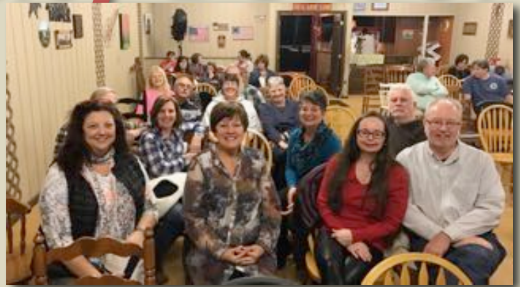
The Valley Grass Band - these guys are worth the price of admission. Superb music, great jokes and lots of fun!