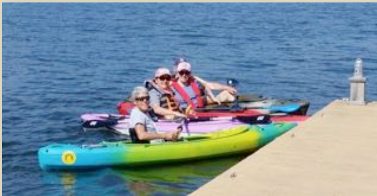
First kayak run of the season!